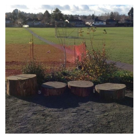
Fall District work nearing completion (thank you)