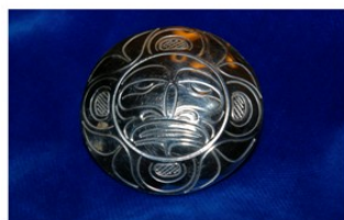
Moon Pin Pendant