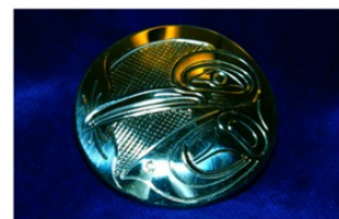
Hummingbird Pin Pendant

Bracelet 1/4" $ 55. each 3/8" $ 65. each 1/2" $ 85. 1" $160. each 1-1/2" $235. each 2" $310.