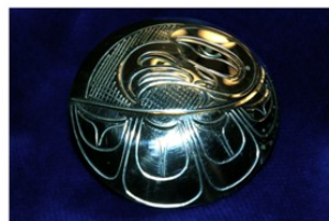
Eagle Pin Pendant